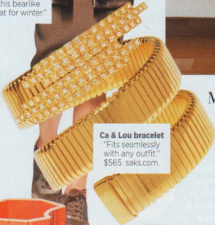
Ca & Lou bracelet "Fits seamlessly with any outfit." $565. saks.com.