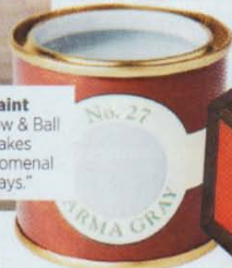
Paint "Farrow & Ball makes phenomenal grays."