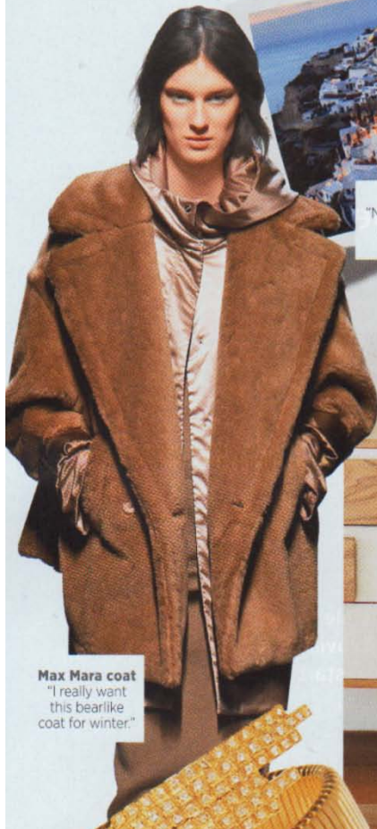
Max Mara coat "I really want this bearlike coat for winter."