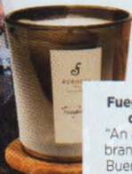
Fueguia 1833 candle "An all-natural brand made in Buenos Aires." $80. fueguia.com.