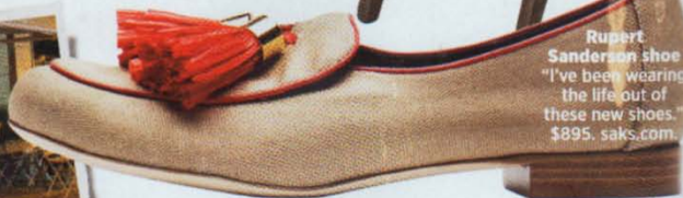
Rupert Sanderson shoe "I've been wearing the life out of these new shoes." $895. saks.com.