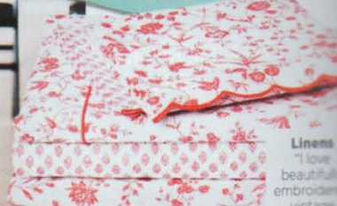
Linens "I love beautifully embroidered vintage sheets."