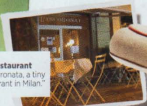
Restaurant "L'Incoronata, a tiny restaurant in Milan."