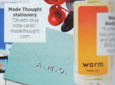
Warm Body oil "It smells like talcum powder and smells like $50 worth of perfume." warm body oil